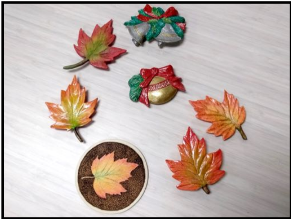
< Chuck Bowlby