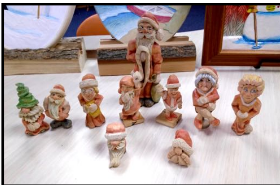
< Roger Lyon