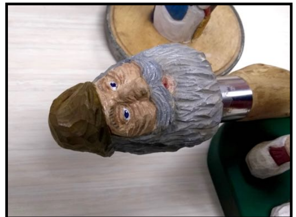
Del Peters >